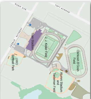
Oshkosh Sports Complex This area is across the Fox River from the main campus.