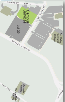
This area is across the Fox River from the main campus.