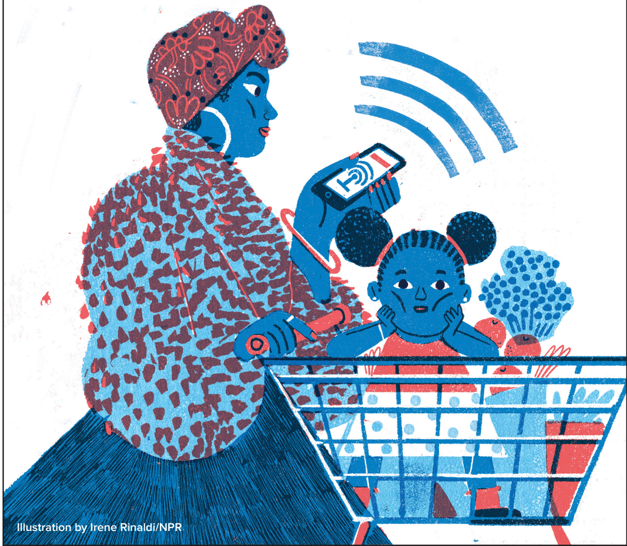
Illustration by Irene Rinaldi/NPR