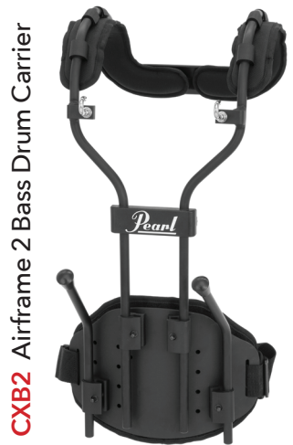
CXB2 Airframe 2 Bass Drum Carrier