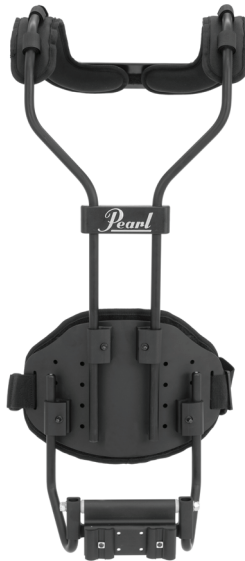
CXS2 Airframe 2 Snare Carrier