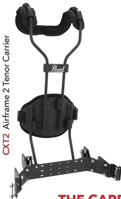
CXT2 Airframe 2 Tenor Carrier